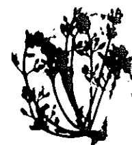
Figure 1 - Effect of fall vegetative shoot elongation of the season