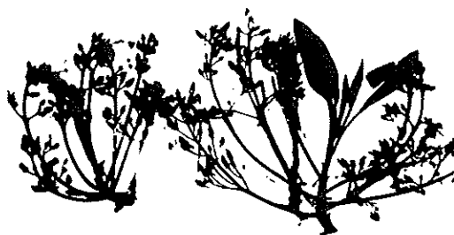
Figure 2 - Control (untreated) indeterminate inflorescence exhibiting normal vegetative shoot development (left) and precocious vegetative growth of inflorescences produced by summer shoots treated with GA 3 (100 mg/liter) on January (right). Picture taken on 5 March 1994.