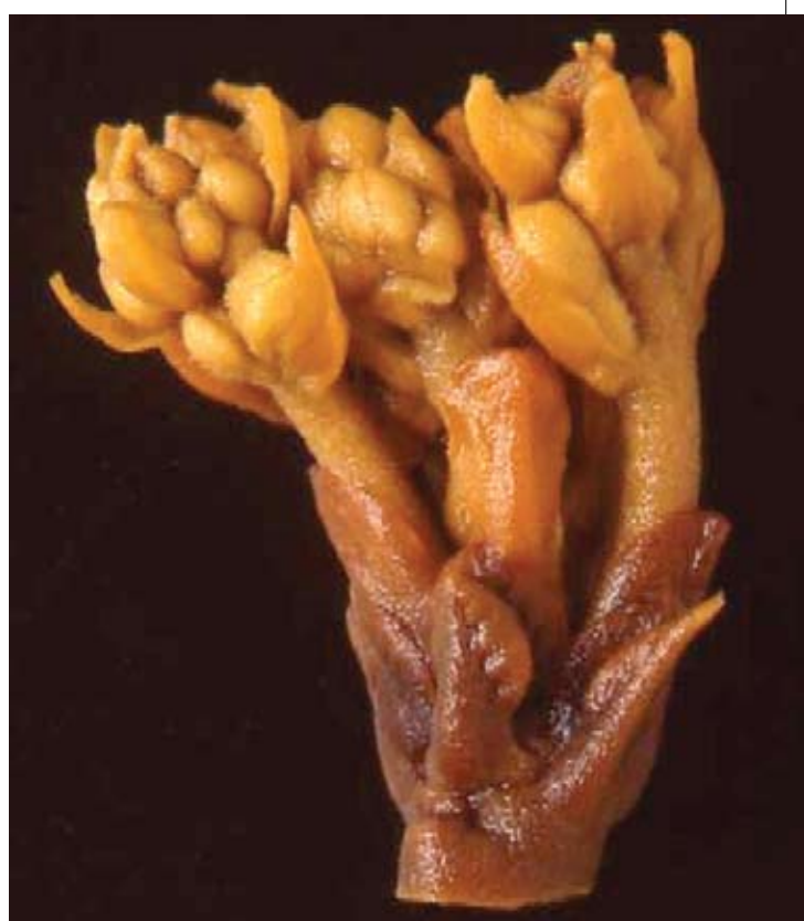
Figure 1. Cauliflower stage inflorescence during early bloom of 'Hass' avocado.

Dose and Dilution Rate. The sprays should be applied like a pesticide spray to give full canopy coverage, especially of the developing inflorescences, but not sprayed to run-off. For ground application, use 12.5 fluid ounces of ProGibb LV Plus® (equivalent to 25 grams of active ingredient) in 100 gallons of water per acre. For aerial (helicopter) application, use 12.5 fluid ounces in 75 gallons of water per acre. The maximum allowable dose is 12.5 fluid ounces per acre per year. The results